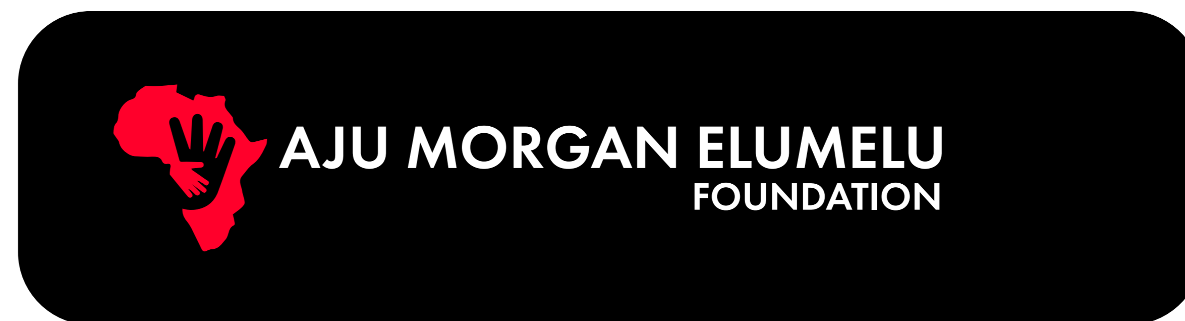
Color with Name Use this with content that's colorful and laid out vertically.