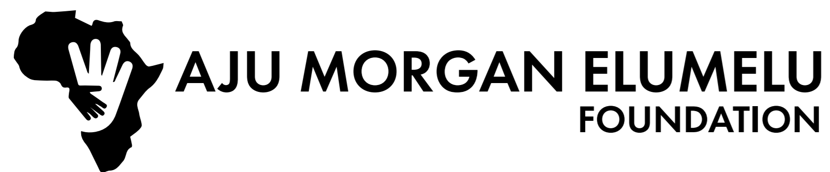
Monochrome with Name Use this with content that's black and white and laid out vertically.