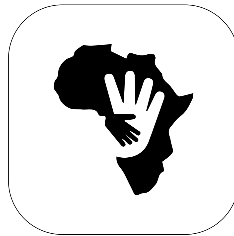
Black & White Use this with content that's primarily black and white.