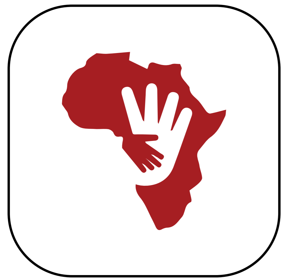
AMEF Logo Use this whenever possible.

The AMEF logo is a product of superior craftsmanship.